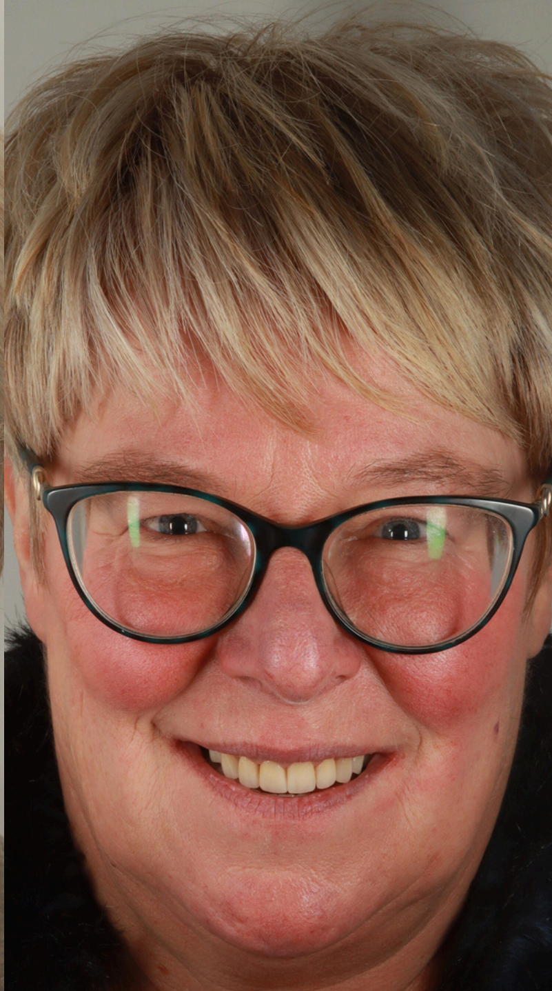
Treated with crowns, veneers and implant supported dentures